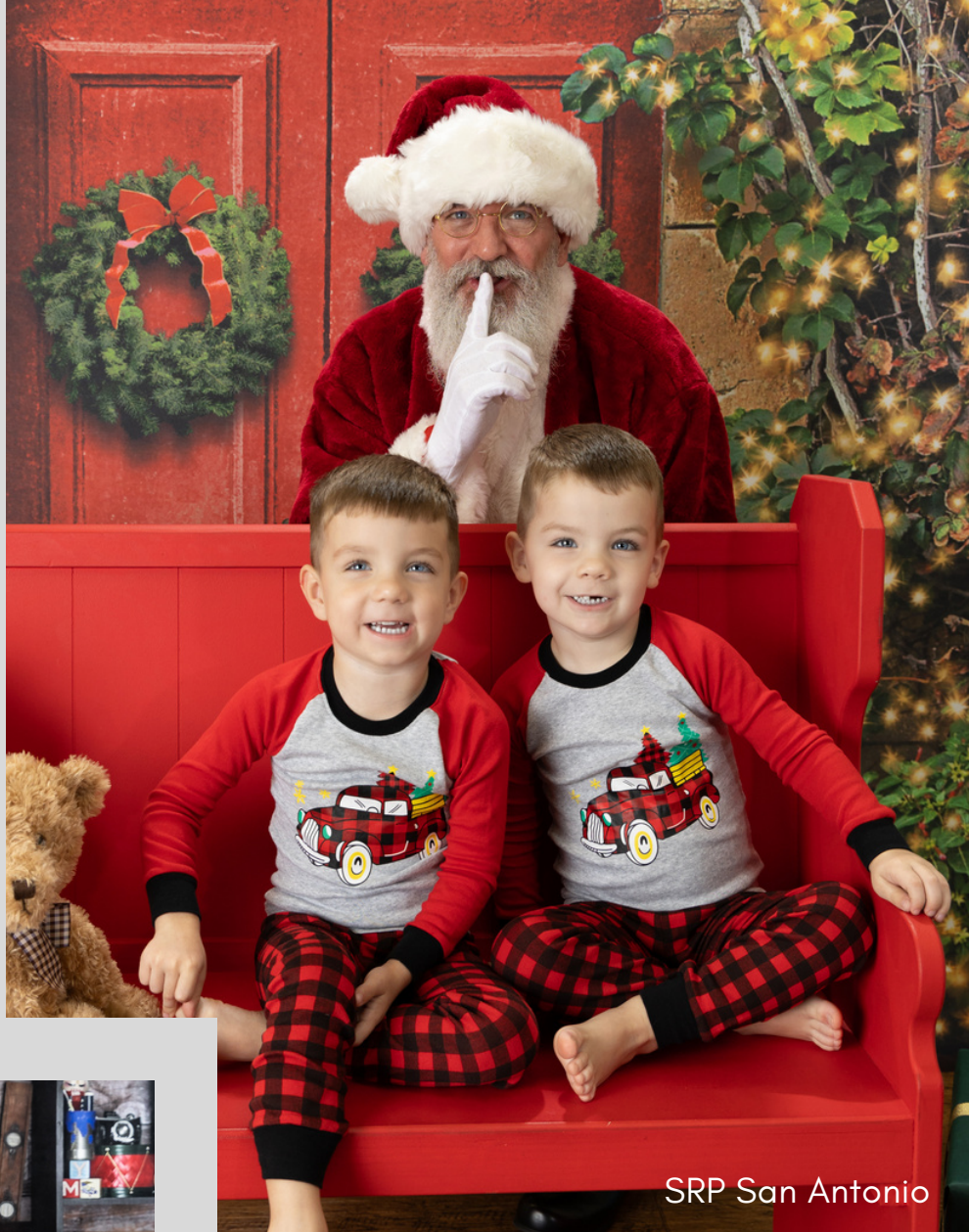
SRP San Antonio