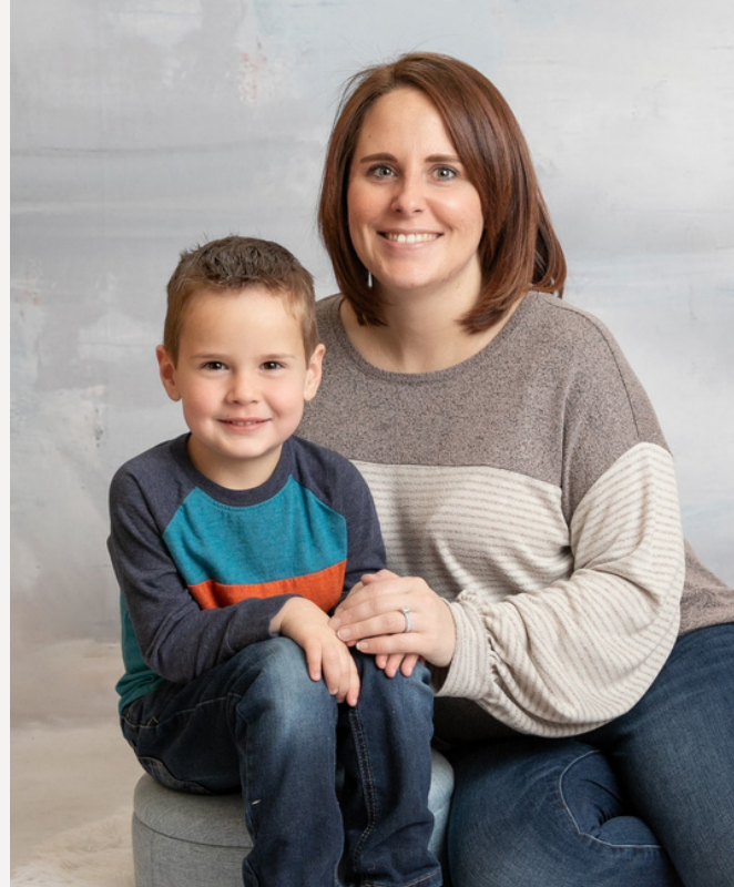
One of LSP's newest directors in Omaha, NE

We are grateful, Little Sunshine's Playhouse chose our purple crown photographers to treat their families to a royal picture day experience each season!